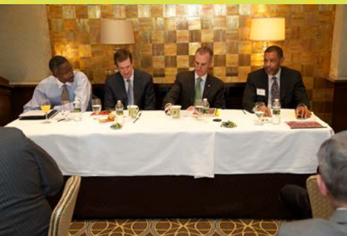
This year's outstanding CEO Symposium panel