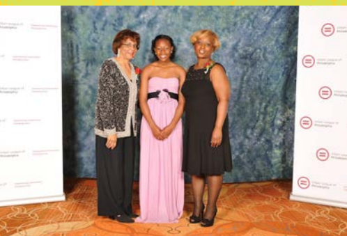
Celebrating 70 years of the Urban League Guild at the National Conference