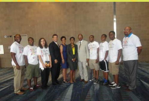
ULP board members with our youth delegation at the National Conference