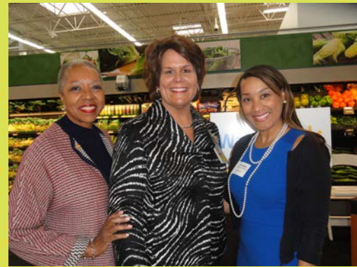
The grand opening of a new Walmart in North Philadelphia